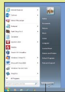
Shut Down button